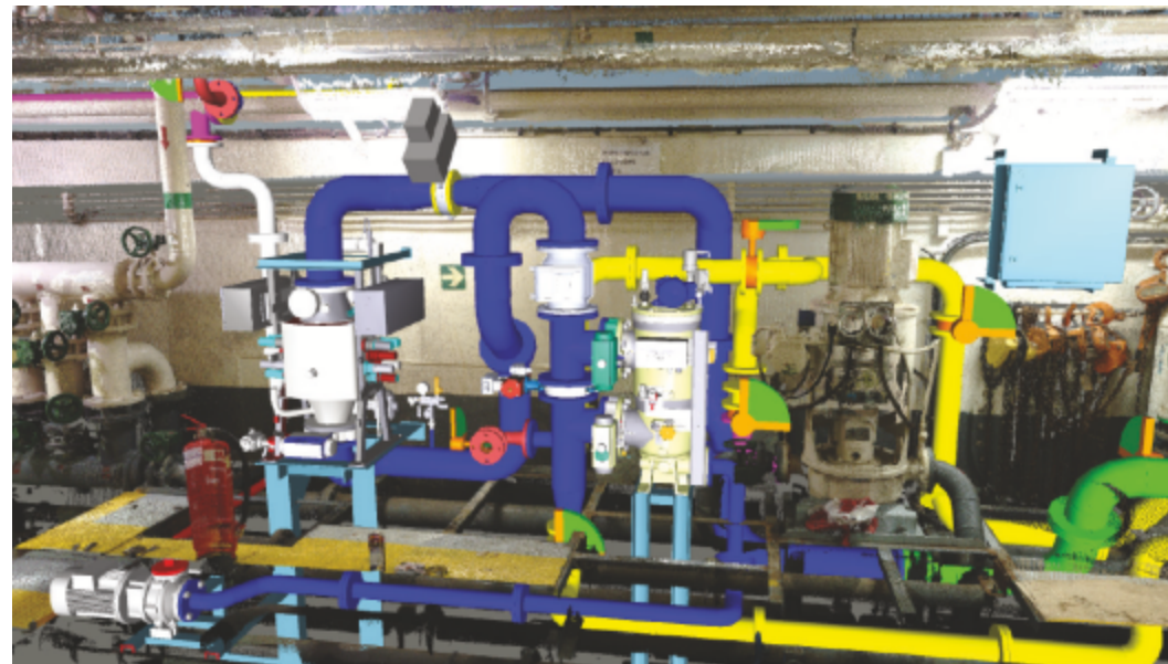
Optimized arrangement of a ballast water treatment system on OSV multiplied by 3 vessels.

As a result of the accuracy of the scanning and the excellent collaboration between the planning and engineering departments, the project was executed millimeter level accuracy.