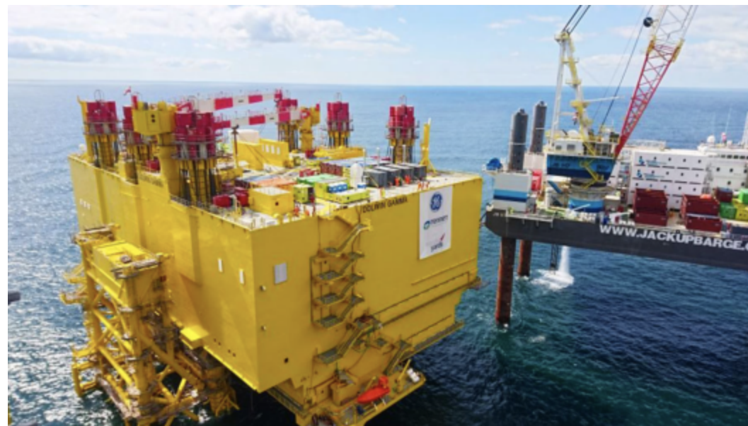
Offshore Platform DoWin gamma (HVDC offshore platform)

We delivered a comprehensive structural report confirming the adequacy of the deck and grillage under the new MLQ configuration. The FEM analysis demonstrated compliance with EUROCODE and DIN 18088 standards, with only minor local exceedances in the platform structure found to be non-critical and solutions to improve the grillage structure for the rule-updated loads. The study enabled TenneT to proceed confidently with MLQ reconfiguration and supported the documentation needed for class approval. The outcome: a verified, certifiable, and regulation-compliant solution for extending the service life and operational capability of the accommodation infrastructure.